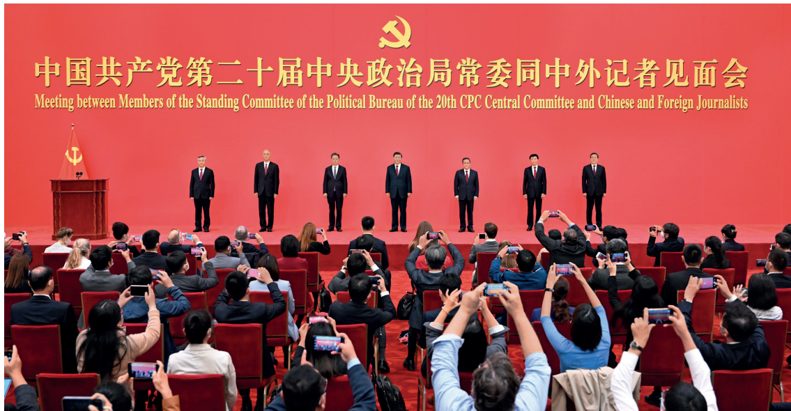
General Secretary Xi Jinping and the other members of the Standing Committee of the Political Bureau, Li Qiang, Zhao Leji, Wang Huning, Cai Qi, Ding Xuexiang, and Li Xi, meet members of the local and international press at the Great Hall of the People, Beijing, October 23, 2022. They were elected at the recently concluded First Plenary Session of the 20th CPC Central Committee.

long-term experiments and experience of the CPC and the Chinese people, and it is a great yet arduous undertaking. But the enormity of the task is what makes it great and glorious.